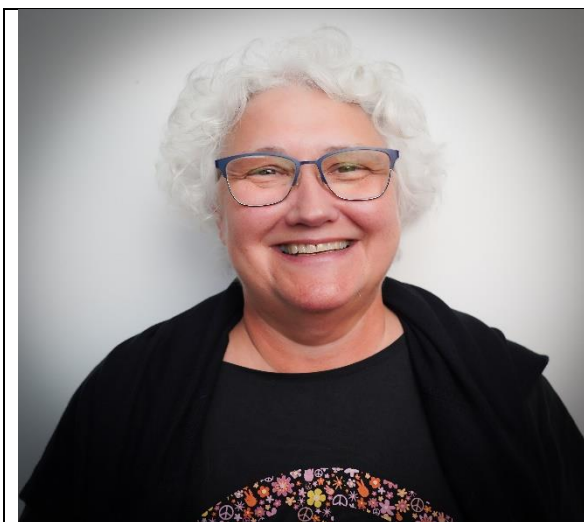
Deputy Head of Law, Leadership & Business

The department has a number of roles that are assigned to staff. Listed below are the team members and their key roles and research interests.